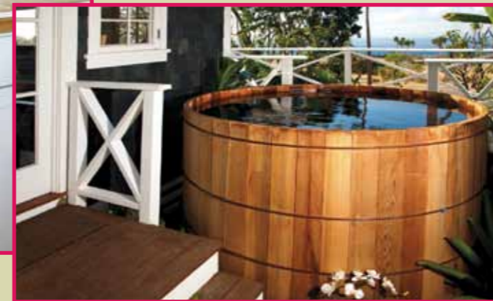
Guests at James Cottage can soak in a hot tub located off the back porch.