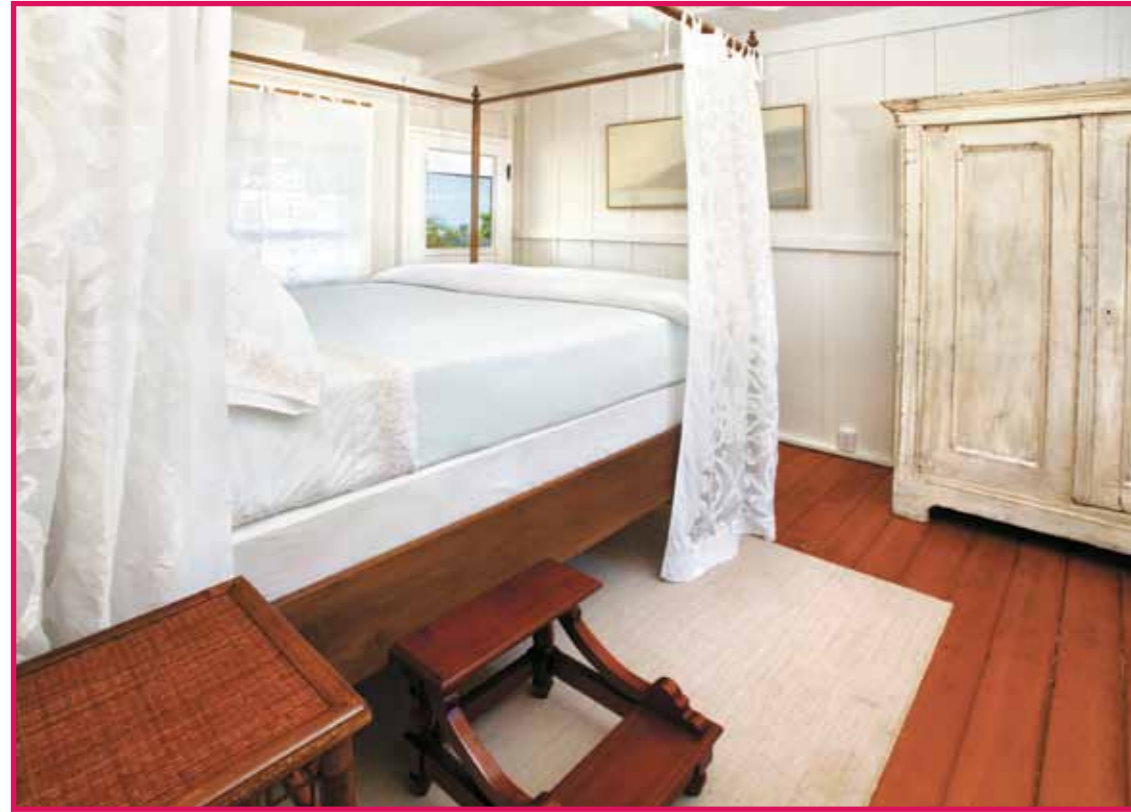
Cowboy House has three bedrooms; this one can be entered from the living area or off the front porch. Furnishings reflect a breezy country style that complements the original Douglas fir flooring and single-wall, board-and-batten construction. Local carpenters crafted the bed.

KALOKO SHUTTER; 4.7383 in; 5.25 in; Black plus three; 000052110r1