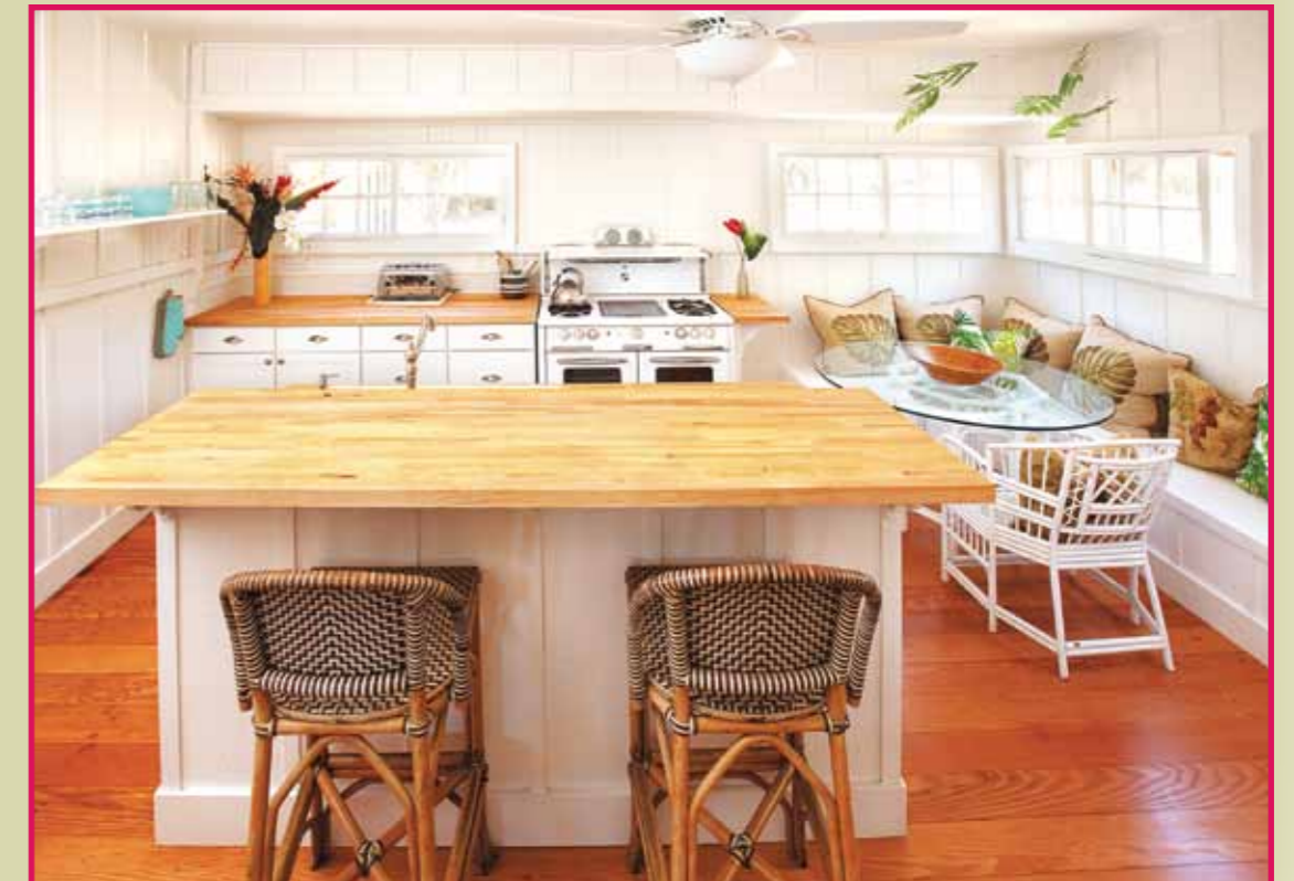
The newly refurbished kitchen was once a detached cookhouse back in the day. It was physically relocated and attached to Cowboy House in the 1960s. Christie and Jay added the window seat and butcher-block cooking island, incorporating the board-and-batten look for the base. The flooring and windows are original to the cookhouse.