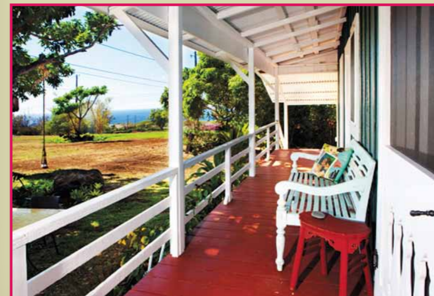
Cowboy House unveils glorious views of Puakea Bay from the front porch.