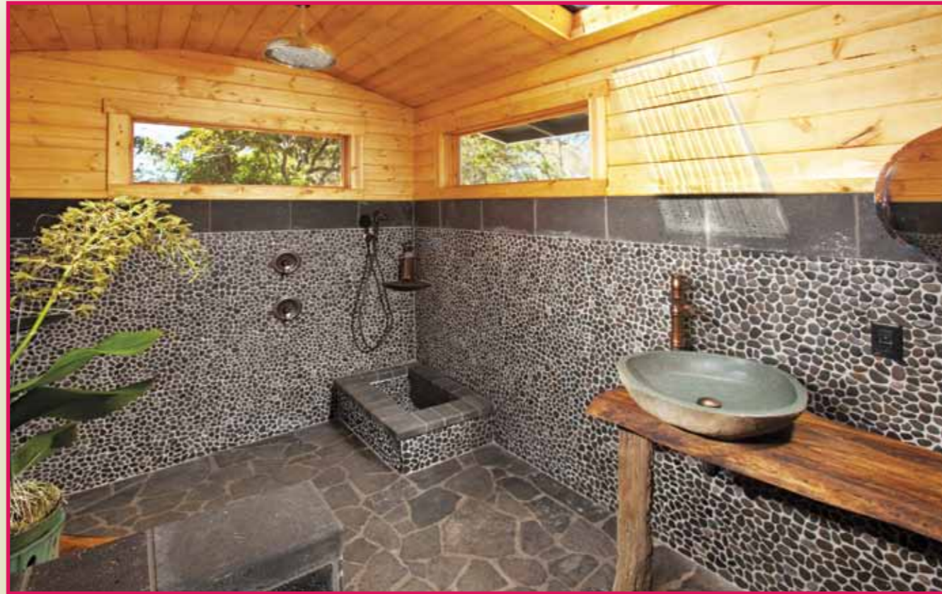
This amazing bathroom occupies the existing footprint of the original washhouse used by the cowboys, which included a Japanese furo. Sheets of ili ili stone came from Tile Warehouse, while the blue rock tiles are broken remnants from West Hawaii Concrete. Aloha Woods provided the lychee slab for the sink, as well as Douglas fir for the tongue-and-groove ceiling.